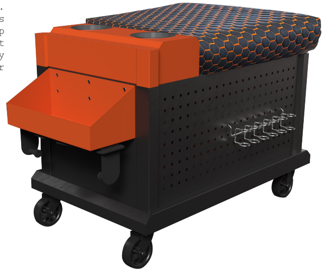
SF-GST100 with Upgraded Upholstery