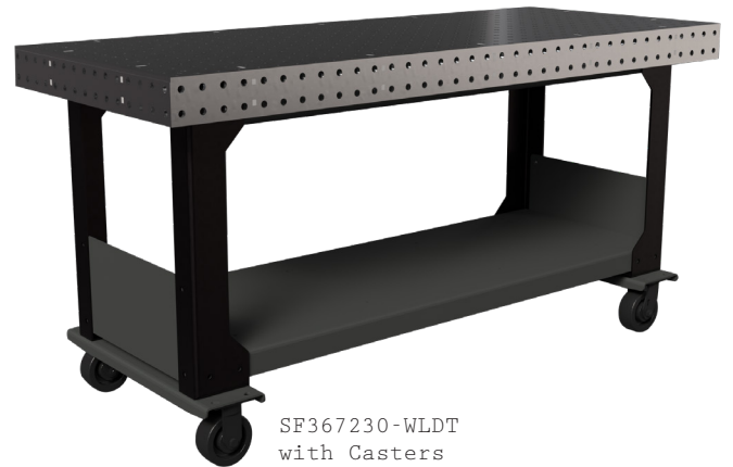
SF367230-WLDT with Casters