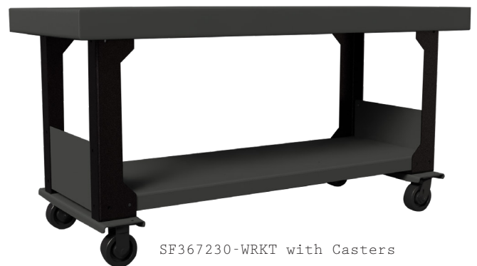
SF367230-WRKT with Casters

*All dimensions are approximate and may vary due to standard manufacturing tolerances.